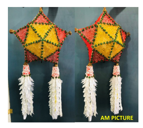
3rd Prize Bulacan Medical Society