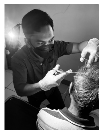
3rd Prize North Cotabato Medical Society