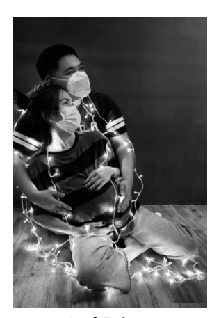
2nd Prize Bulacan Medical Society