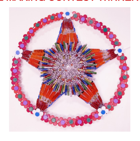
2nd Prize Pangasinan Medical Society