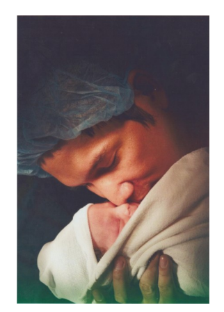
1st Prize Quezon City Medical Society