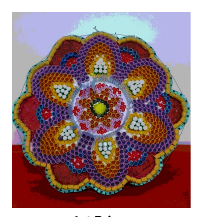
1st Prize San Pablo City Medical Society